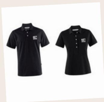
Polo Shirts $45.00