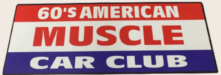
Cap & Stubby Holder & Cap & Key ring Combos : $20.00 Key Rings $10.00 Cloth Badges $3.00 Stickers $2.00