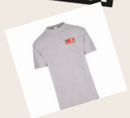
Black & Grey T's $35.00