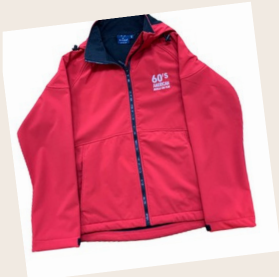
Ladies & Mens Jackets From $75.00